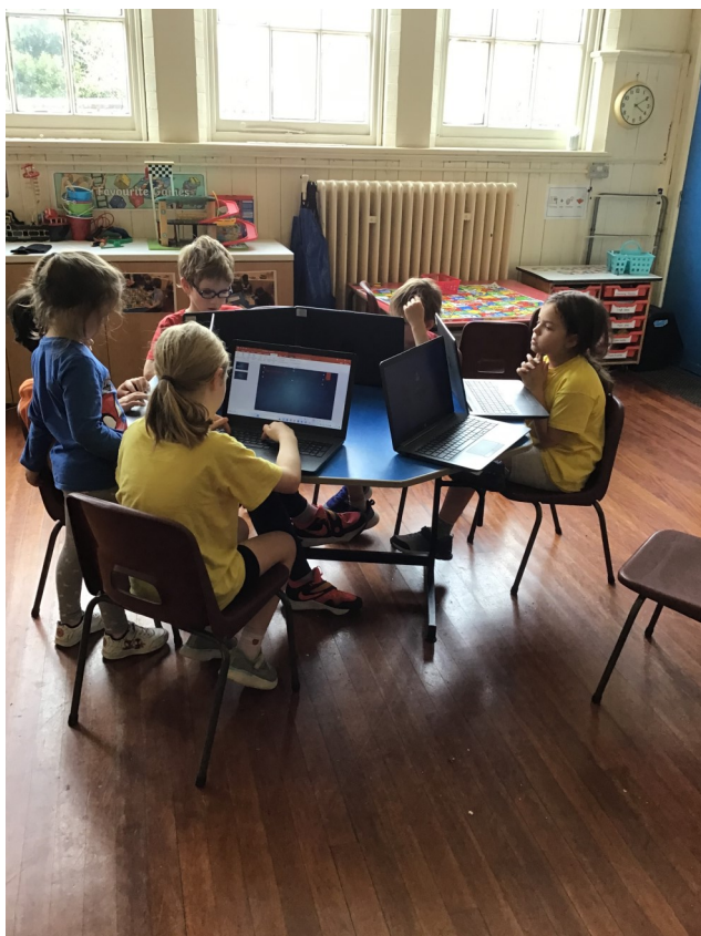
Computer games and homework!