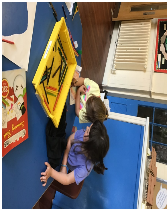
Creative Station 1